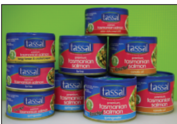
Tassal's new canned Salmon products

which has proven benefits for heart, skin and hair health and a range of other diseases and conditions.