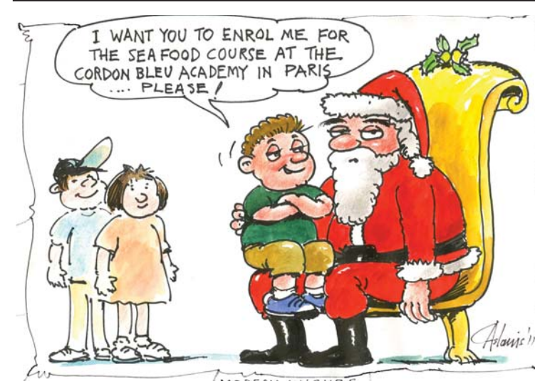
Illustration: Con Aslanis