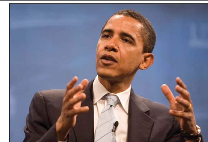
The President of the United States of America, Mr. Barack Obama who recently visited Australia and was treated to a meal of Australian seafood.

We asked a number of renowned chefs what Continued on page 2